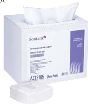
Aerospace grade wipes, 30cm x 42cm, 250 wipes per box (Code: AC12165)